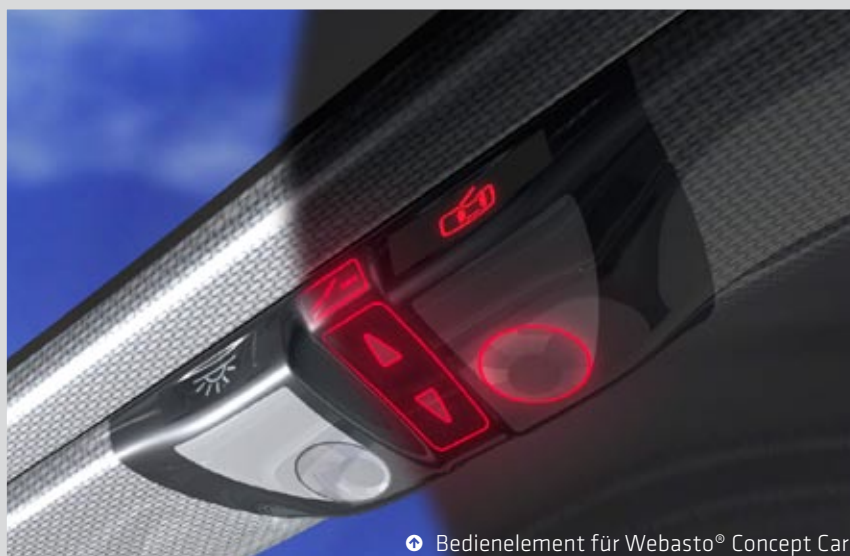
Bedienelement für Webasto® Concept Car